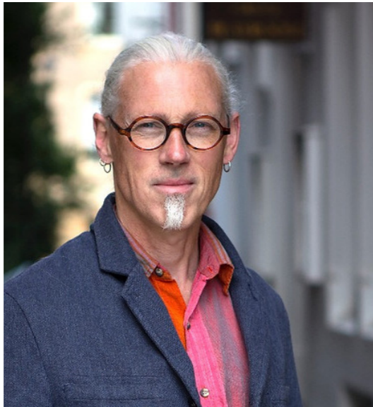
Meredith Bowles Mole Architects